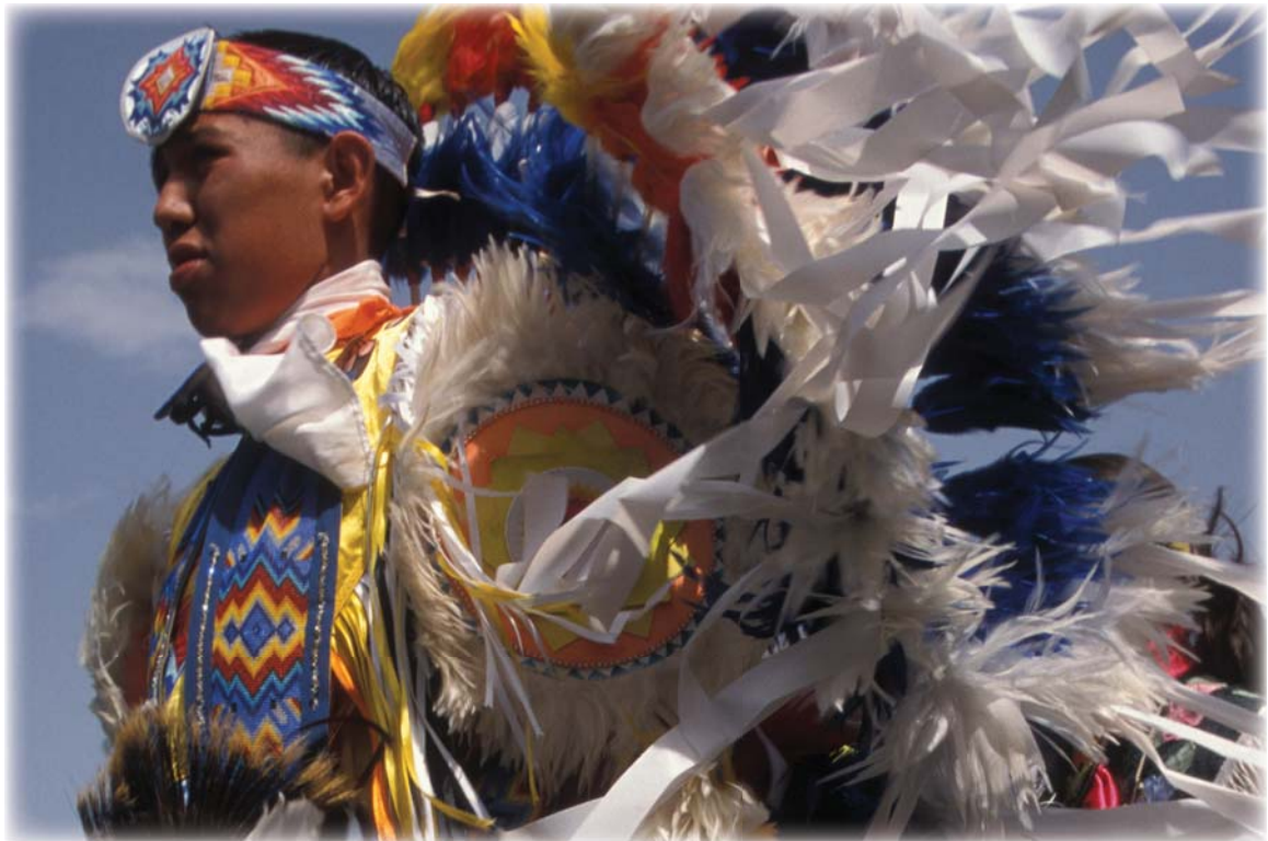
Crow Fair Dancer

All youth 16 and older who are currently under the care and custody of the state, the tribe, or the BIA are eligible for Montana Foster Care Independence Program transitional services. Youth ages 18-21 are also eligible.