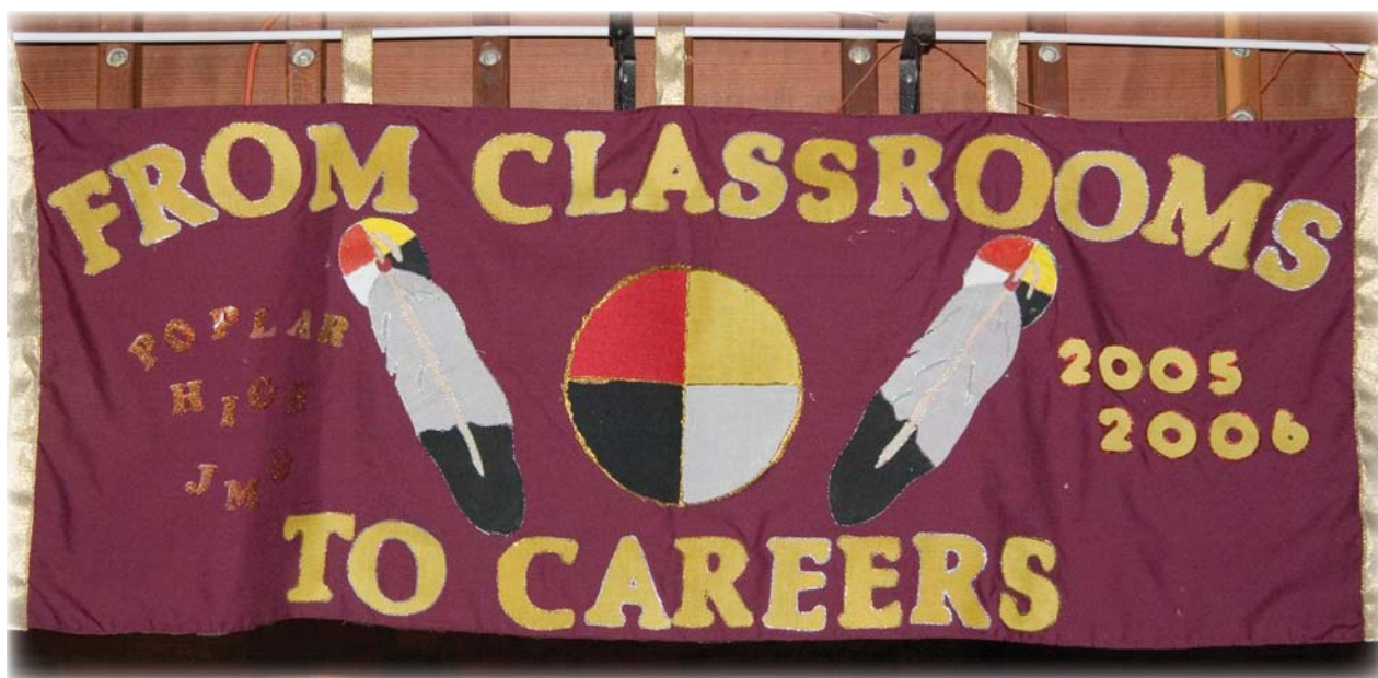
Jobs For Montana Graduates Banner – Photo courtesy of Poplar High