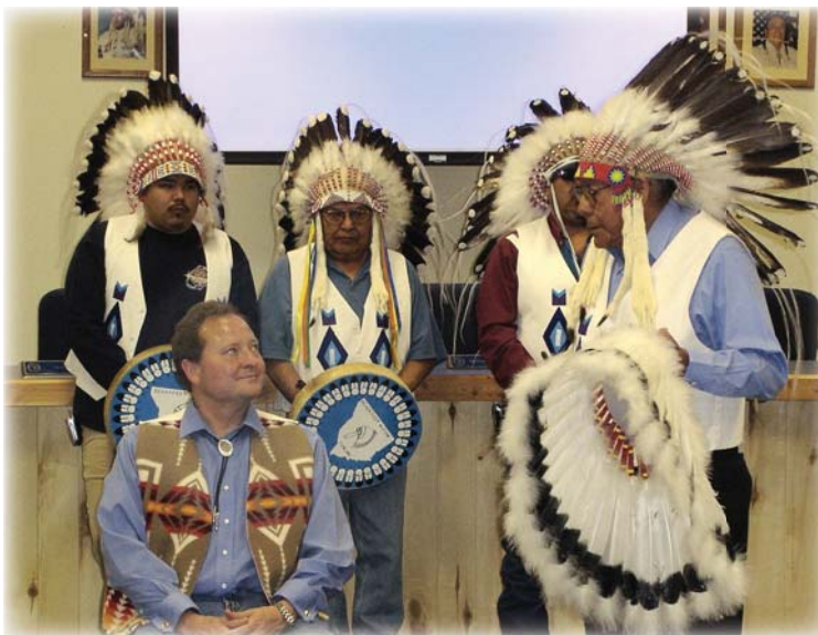
Blackfeet Nation honoring Governor Schweitzer

Montana has a $30 million-a-year highway construction industry. American Indians are increasingly finding steady work throughout the state on Montana Department of Transportation road construction projects. To encourage this trend, in November of 2006 the Montana Department of Transportation awarded the Salish and Kootenai College a grant of $398,311 to help fund its "Highway Construction Training School." The school trains American Indians in heavy equipment operation and truck driving skills. The grant will assist in the recruitment of American Indians into the program, the financial aid process, admissions, registration, career counseling, and job placement and retention. The program includes tutoring and daycare for the dependants of participants.