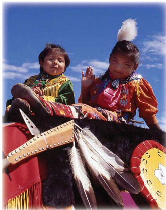
North American Indian Days

To further increase eligibility, the Department is moving forward with the establishment of a new model for the provision of Medicaid benefits in Indian Country. The Rocky Boy's tribal government is well into negotiations with the State to assume management of a portion of family-related Medicaid eligibility. A contract has been drafted and is under review. Training is also planned for the tribal staff that will provide services under the contract.