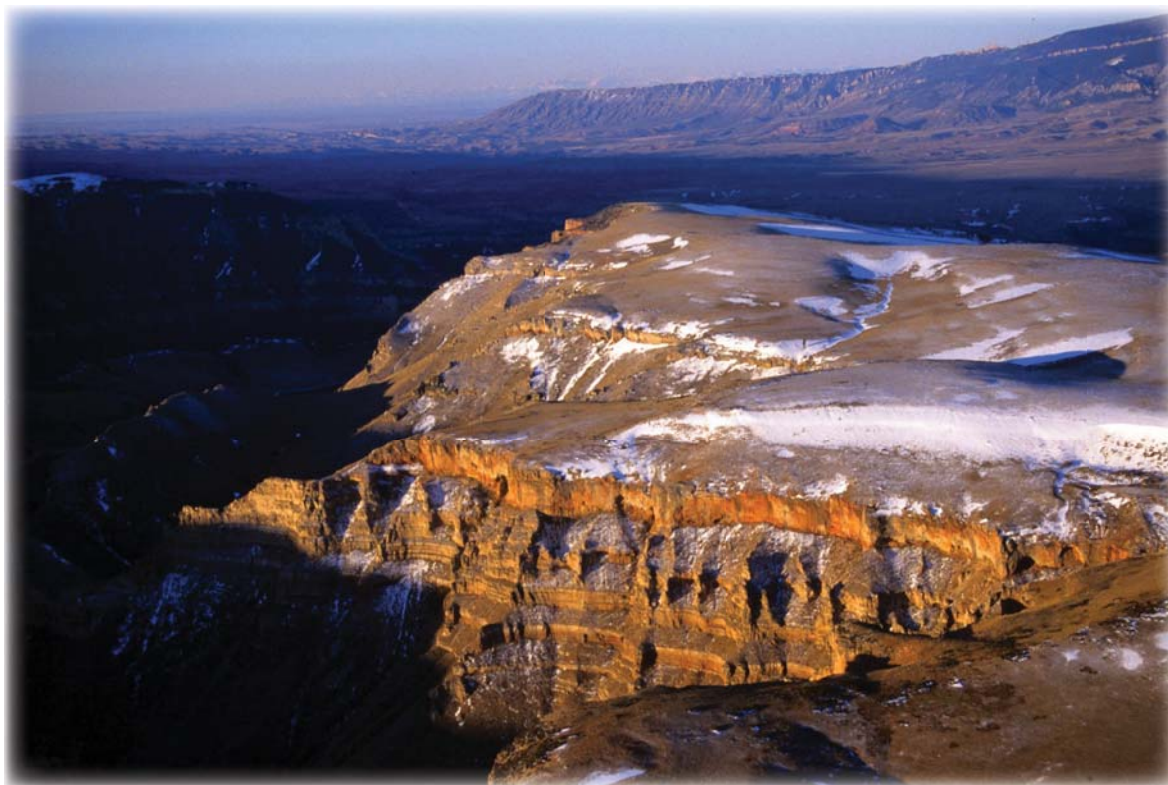
Bighorn Mountains

In August of 2006, CFSD supervisors received cultural competency training on the strengths of American Indian children and the Indian Child Welfare Act. In addition, the CFSD Newsletter, which is disseminated six times a year, regularly includes multicultural information and information about state-sponsored trainings and conferences. These newsletters are sent to tribal social service agencies.