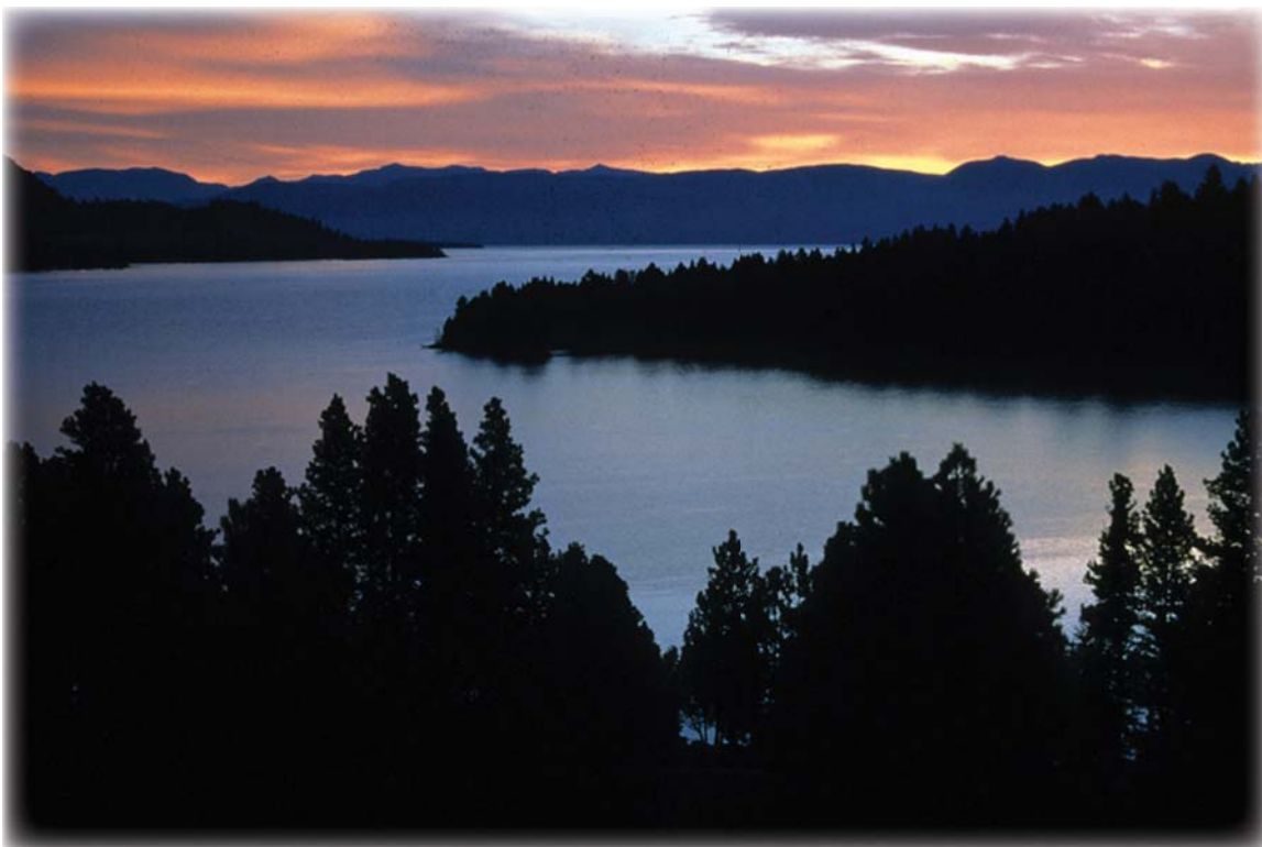
Flathead Lake

Existing gaming compacts with Montana Tribes are either up for renewal, or are so old as to need renegotiation. Working within the requirements of state and federal law, the State in 2006 engaged