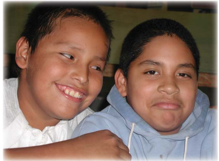
Northern Cheyenne Boys and Girls Club