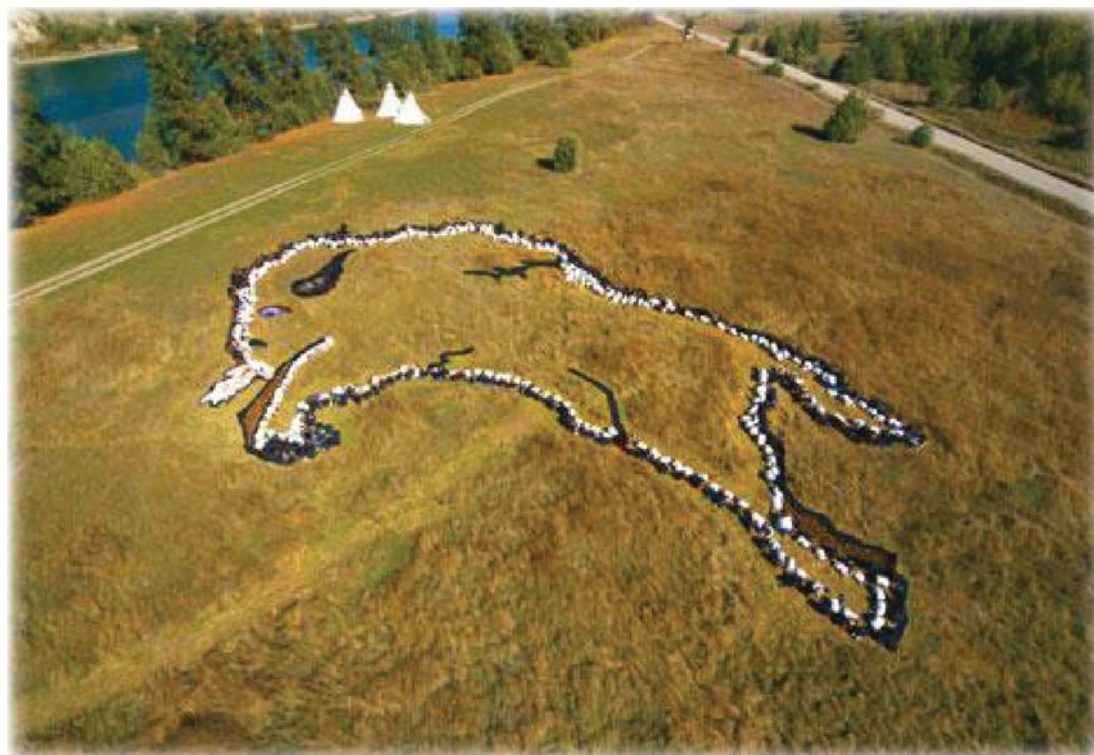
Big Medicine – Art for the Sky Project