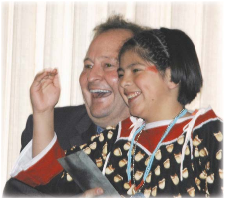
Governor Brian Schweitzer & Child – Governor's Prayer Breakfast

These principles are reflected in state law and are being implemented at all levels of state government. 1 The first executive order issued by Governor Schweitzer created a task force of advisors and agency directors to ensure that the hard work of governance, for both the State and the Tribes, moves forward in the context of sovereign cooperation. Agencies throughout state government have also initiated or continued efforts to promote communication and consultation on issues affecting Indian Tribes and populations.