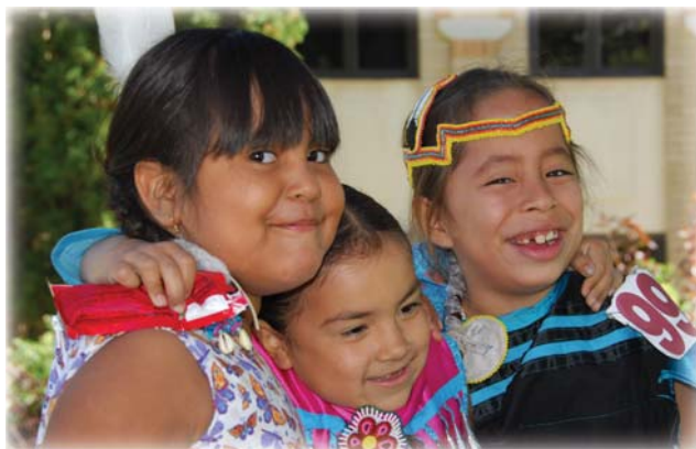
Last Chance Community Pow Wow

students, regardless of economic background, to attain a postsecondary education through early college and career awareness activities, scholarships, financial aid information, and improved academic support. Montana GEAR UP works with 25 middle schools and their receiving high schools around the state that are in low income communities and have students who are educationally at risk. Two-thirds of GEAR UP schools are located on or near Indian reservations.