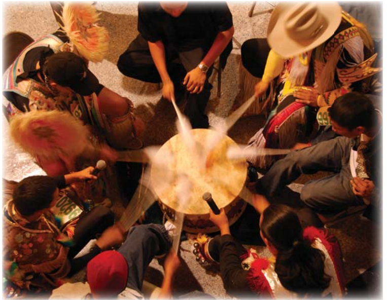
Last Chance Community Pow Wow