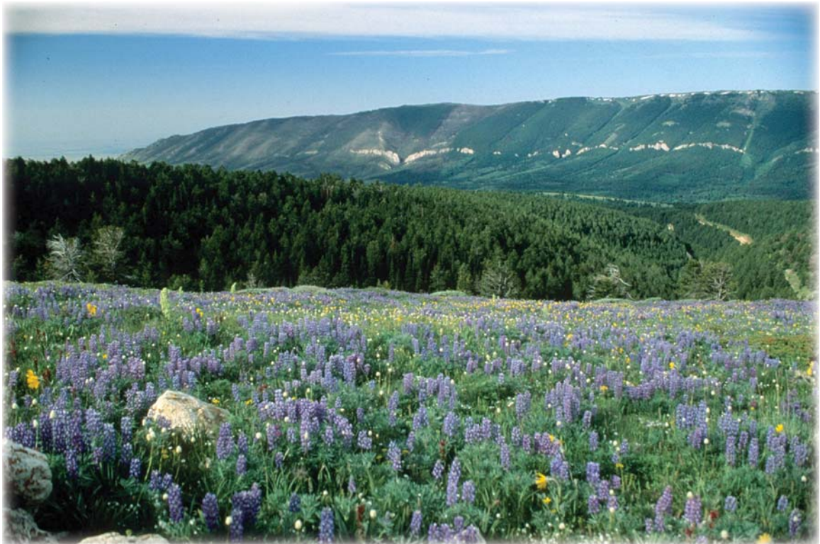
Pryor Mountains

Westmoreland Resources Inc. (WRI) operates the Absaloka Mine on the Tract III Coal Lease north of the Crow Indian Reservation. WRI owns the surface, and the Crow Tribe owns the coal. The mine operates under permits from DEQ and the federal Office of Surface Mine Reclamation and Enforcement (OSM).