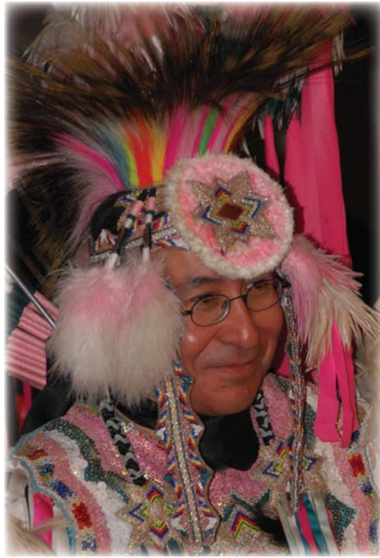
Last Chance Community Pow Wow.

The Department of Corrections has been working in 2006 with the Northern Cheyenne Tribe to develop an MOU to allow for the monitoring of tribal members in their own communities, who are on state probation or parole. It is hoped that community monitoring will increase the support available to Northern Cheyenne tribal members and reduce the risk of revocation and incarceration.